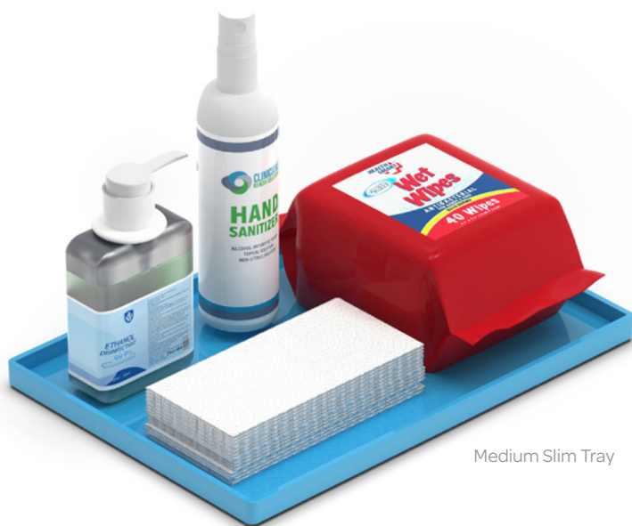
Medium Slim Tray

Keep our easy-to-clean trays on desks, conference tables, and shared spaces to keep your sanitation products handy.