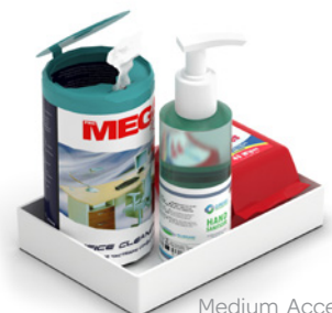
Medium Accessory Tray