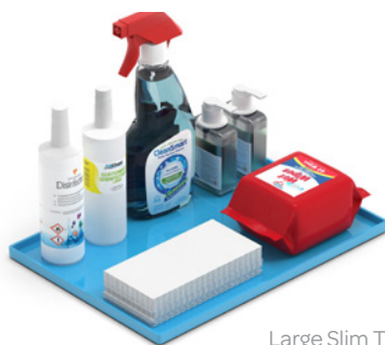
Large Slim Tray