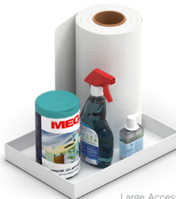
Large Accessory Tray