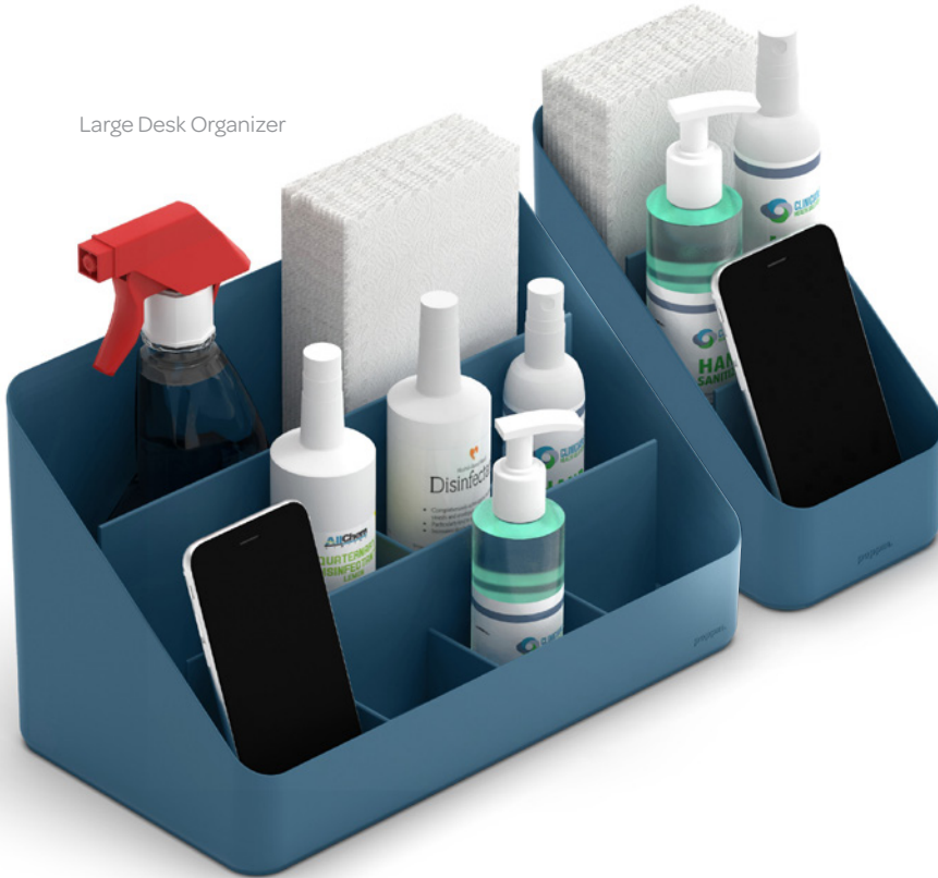
Large Desk Organizer